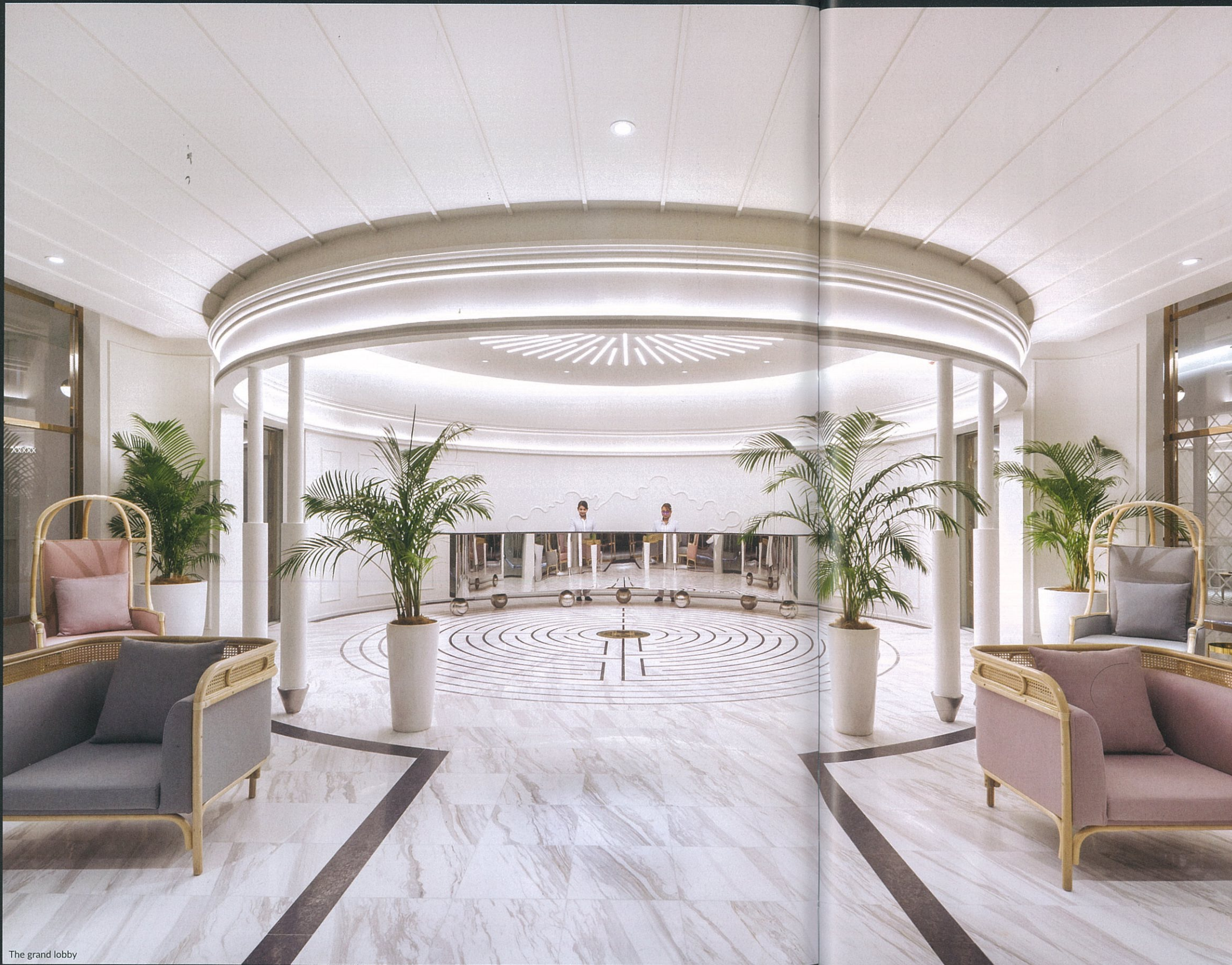
The grand lobby