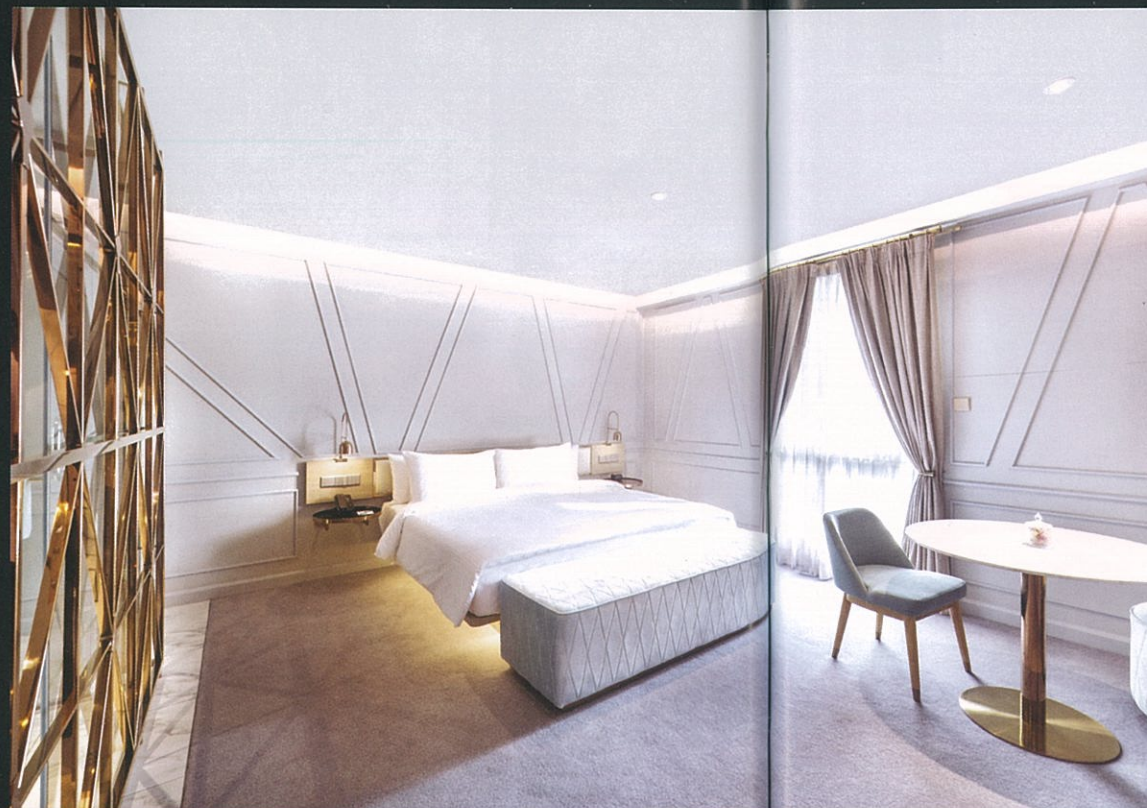
Trapezoidal wainscot and bronze-tinted decorative elements in the bedroom