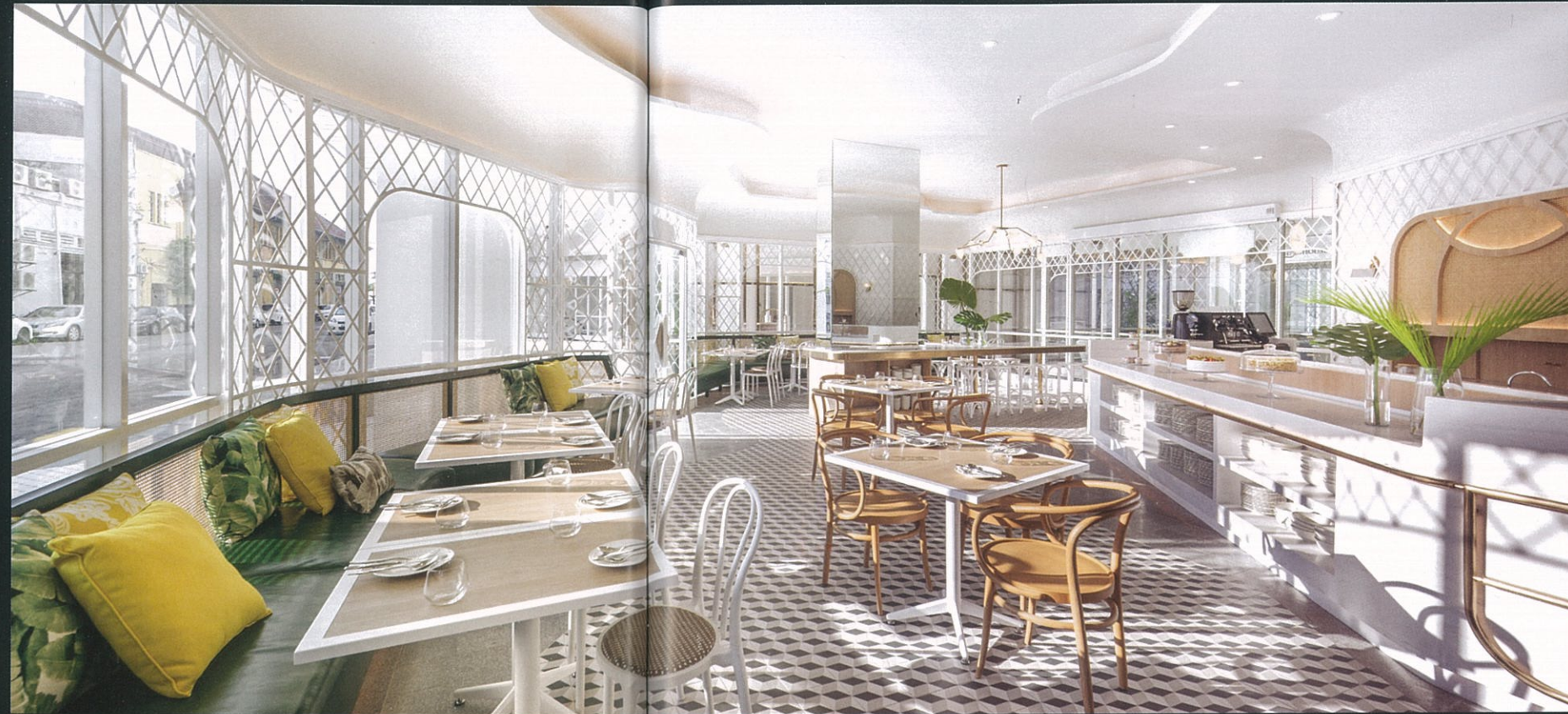
Combining the use of white metal lattices and tropical plants and colours