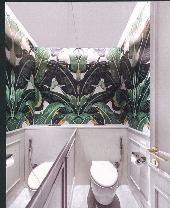
Toilet behind a door that looks like a wardrobe