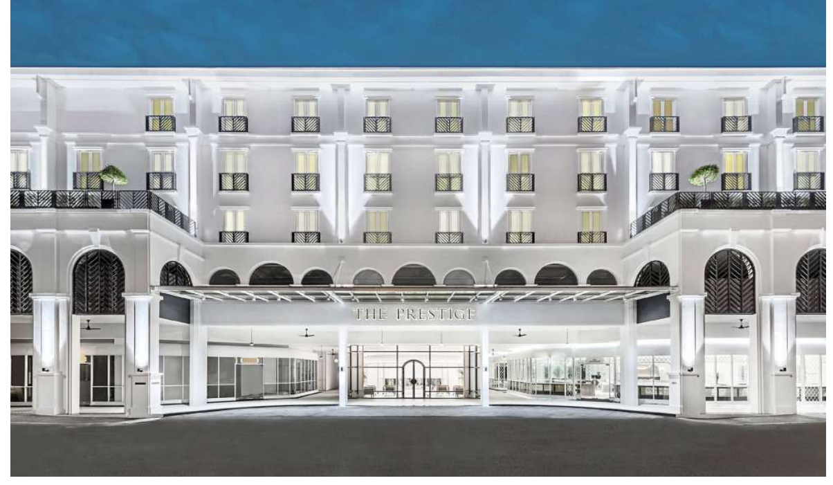
The facade of the Prestige Hotel in Penang represents a modern-day interpretation of colonial Victorian design. In the reception area, expect several tongue-in-cheek references to magi-

4 Spaces STARLIFESTYLE, MONDAY 21 OCTOBER 2019