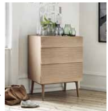
Silent Vases for Muuto

“WE ALL NEED TO CONSUME LESS AND HAVE A MUCH STRONGER SCOPE AND APPRECIATION OF QUALITY, SUSTAINABLE PRODUCTS.”