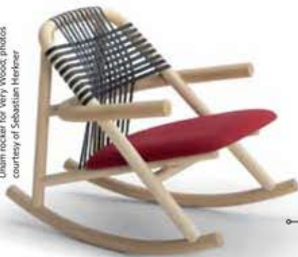
Unam rocker for Very Wood

“WE ARE LIVING IN A GLOBALISED WORLD AND GET INFORMATION VERY FAST ONLINE, SO VIRTUAL LIFE WILL BECOME MORE IMPORTANT. ON THE OTHER HAND, WE WILL WANT SLOWER, MORE AUTHENTIC MOMENTS IN OUR PRIVATE HOMES. THERE, IT’S ABOUT SUSTAINABILITY, QUALITY, STORYTELLING AND HOSPITALITY.”