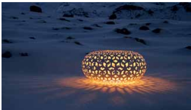
Snowflake lamp; photos courtesy of David Trubridge

“IT’S NOT GOOD FOR HUMANS TO BE CONSTANTLY SURROUNDED BY CONCRETE. SO IN OUR HOMES, WE NEED TO SEE TREES AND PLANTS, AND WE NEED TO SEE DESIGN THAT EXPRESSES AN ESSENCE OF NATURE.”