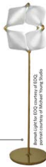
Bramah Light for EQQ, courtesy of EQQ

"I PRAY IN 20 YEARS THAT INTERIORS WILL LOOK AS THEY DO NOW, AND IT IS OUR VALUE AND APPRECIATION OF WHAT WE POSSESS THAT BECOMES THE REAL VISION."