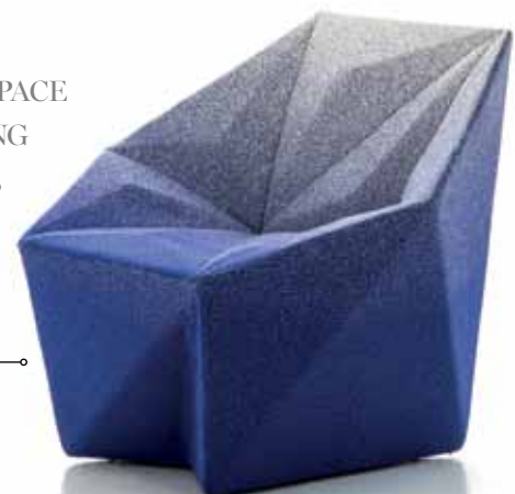
Gemma Chair by Daniel Libeskind

“SPACE WILL BE THE ULTIMATE LUXURY. BUT IT WILL NOT BE NECESSARY TO HAVE A LARGE SPACE TO LIVE WELL. LIVING WELL WOULD MEAN HAVING PEACE OF MIND, ACCESS TO NATURE – BLUE SKY, GREEN SCENERY, FRESH AIR AND WATER – AND GOOD FOOD. AND A GREAT MEANS FOR COMMUNICATING WITH OTHERS.”