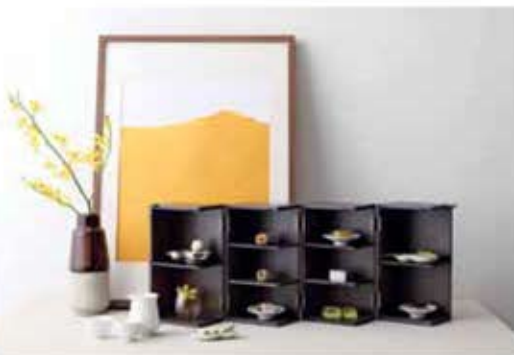
Canto Box by Gary Chang for JIA; photos courtesy of JIA

"THE KITCHEN WILL BECOME THE PLACE WHERE MOST PEOPLE SPEND THEIR TIME. IT WILL EVOLVE AND BECOME MORE THAN A PLACE WHERE YOU PREPARE A MEAL OR WASH THE DISHES - THE KITCHEN WILL TRANSFORM INTO A PLACE WHERE YOU EAT, DRINK, PLAY, WORK AND RELAX."