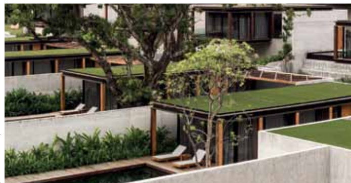
The Naka Phuket courtesy of The Naka Phuket; portrait courtesy of DBALP

“MAYBE DESIGN IS NOT ABOUT ASKING WHAT’S NEW OR WHAT’S THE CONCEPT, BUT WHAT IS POSSIBLE WITHIN THE CONTEXT? IN THAT WAY, THINKING MIGHT ALLOW A MORE FLUENT CREATIVITY.”