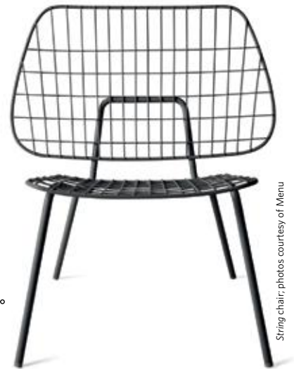
String chair; photos courtesy of Menu

“I HOPE HONEST MATERIALS WILL STILL BE SOMETHING WE APPRECIATE IN THE FUTURE AND THAT PEOPLE WON’T SEEK FAKE ALTERNATIVES – I’D LIKE TO GET RID OF COPYING IDEAS.”