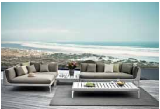
Mu Collection for Dedon

“HOME HAS ALWAYS BEEN CONSIDERED VERY IMPORTANT, BUT WITH THE INCREASE OF PEOPLE’S MOBILITY, I SUPPOSE THAT IN TWO DECADES FROM NOW, IT WILL BE EVEN MORE AN ELEMENT OF STABILITY, SEEN AS AN ANCHOR TO YOUR ROOTS AND FAMILY.”