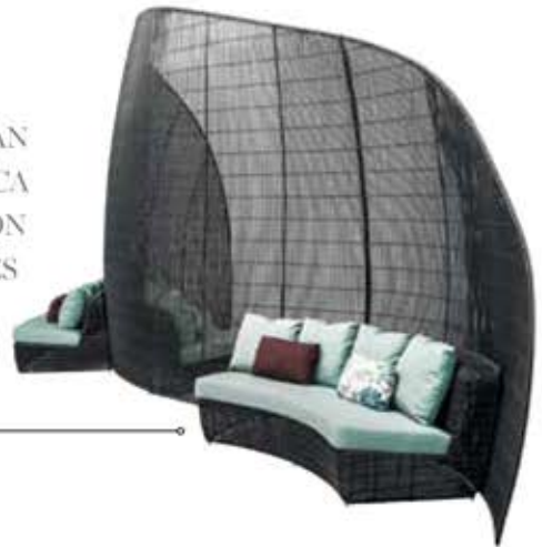
Bespoke furniture for Ananyaya Beach Resort, Bohol

"A NEW HOME BUILT IN AN ASIAN METROPOLIS CAN EASILY LOOK LIKE THOSE BUILT IN LATIN AMERICA OR EUROPE. I WOULD LIKE TO SEE US HOLDING ON TO OUR UNIQUENESS AND CULTURE. OUR HOMES SHOULD BE EXPRESSIONS OF OUR INDIVIDUAL TASTES AND PURSUITS."