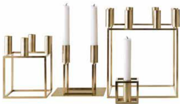
Kubus Brass Family

HEAD OF PRODUCT DEVELOPMENT, BY LASSEN DENMARK | bylassen.com