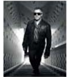
MARTYN LAWRENCE BULLARD

"I BELIEVE HOMES WILL BE SIMPLIFIED, WITH COMFORT AT THEIR CORE. THE ABILITY TO CHANGE THE COLOUR OF THE WALLS AT THE TOUCH OF A SWITCH, PROBABLY PROJECTED FROM A COLOUR-FILTERED LIGHT SOURCE, WILL BE A STANDARD DECORATING PRACTICE."