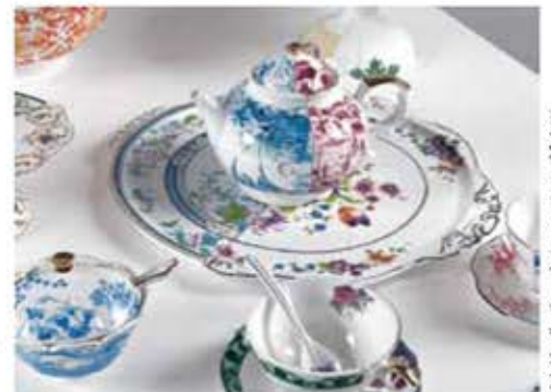
Hybrid collection; photos courtesy of Seletti

“IN THE FUTURE, I DON’T WANT TO SEE SPACES THAT ARE NOT USEFUL, CHAIRS THAT YOU CANNOT SIT ON OR FURNITURE THAT CANNOT BE USED.”