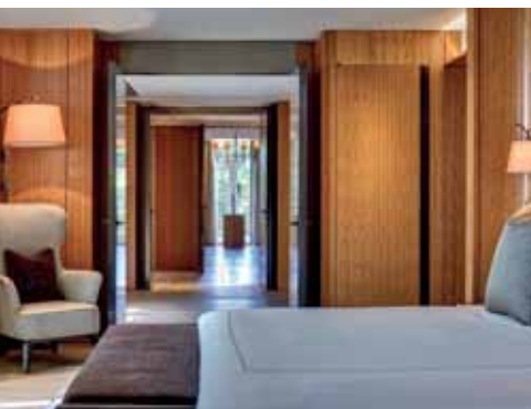
The Berkeley

“A HOME IS ULTIMATELY A PLACE TO LIVE, SLEEP, EAT, DRINK – THERE’S NOTHING COMPLICATED ABOUT IT. I HOPE THAT PEOPLE AND DESIGNERS WILL CONTINUE TO EMBRACE THE SPIRIT OF THAT INSTEAD OF CONTINUALLY TRYING TO CHALLENGE THE CORE VALUE OF WHAT THE HOME IS.”