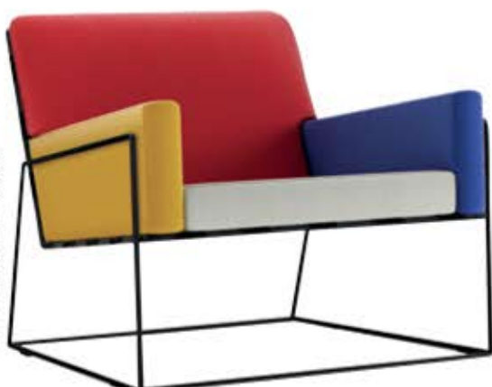
Charlie Chair Composition 14 by Marcel Wanders for Moooi

“PERSONALLY, I TRY TO DO SOMETHING I HAVEN’T DONE BEFORE EVERY DAY. IF THERE IS A CUTTING-EDGE TECHNOLOGY OR A NEW BUSINESS MODEL I ENCOUNTER, I WANT TO KNOW EVERYTHING ABOUT IT, AND LEARN HOW TO PUSH IT FURTHER.”