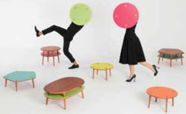
PLAplay collection for Journey East

“EXPECT SPACES TO TRANSFORM AND SUPPORT THE ‘NEW NORMAL’ – LIFESTYLES AT HOME, WITH OR WITHOUT HUMAN INTERVENTION. EXPECT EXCITING TIMES.”