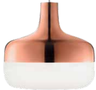
Korona LED light for Alvalarte

“THERE’S GOING TO BE A NEW TREND TO LIVE IN THE COUNTRYSIDE WHEN CITIES ARE GETTING TOO PACKED.”