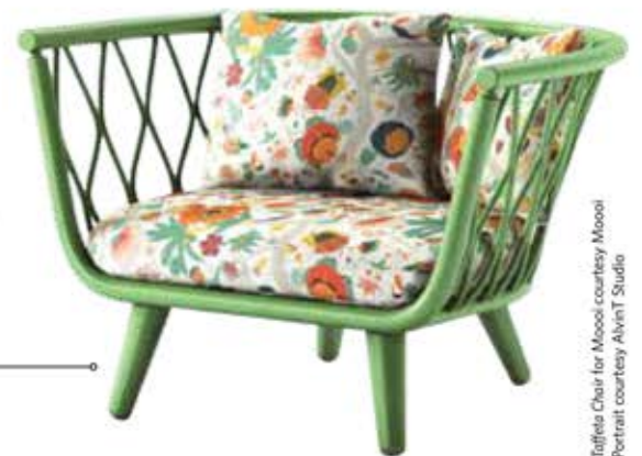
Tajfelia Chair for Moooi Portrait

"IMAGINE IF A HOUSE IS BUILT USING LIVING NATURAL MATERIALS. HAVING A LIVING TREE IN THE MIDDLE OF THE LIVING ROOM IS COMMON - BUT HAVING LIVING TREES AS THE HOUSE STRUCTURE? THE HOUSE CAN ACTUALLY GROW UP WITH THE TREE AND IT WOULD CREATE A DIFFERENT EXPERIENCE OF LIVING."