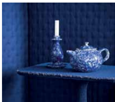
Kieffer by Rubelli collection, 2015/2016 courtesy of Rubelli; portrait by Giovanni Gastel

“SIMPLICITY IS TO ME A WORD FULL OF INSPIRATION, A POWERFUL PUSH TO CREATIVITY. I HAVE ALWAYS ENCOURAGED SIMPLICITY AS A VERY SPECIAL FORM OF BEAUTY. THIS IS A SIMPLE MESSAGE THAT I WOULD LOVE TO CARRY TO THE FUTURE.”