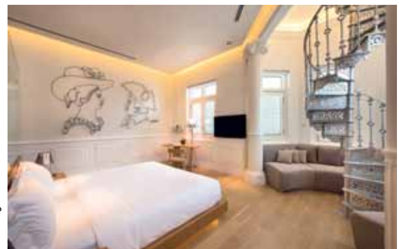
Macalister Mansion

“I THINK THE ROLE OF THE VIRTUAL REALM WILL INCREASE, AND IT WILL ALLOW US TO USE OUR HOMES AS A BASE TO ‘VISIT’ PLACES BEYOND WITH EASE.”