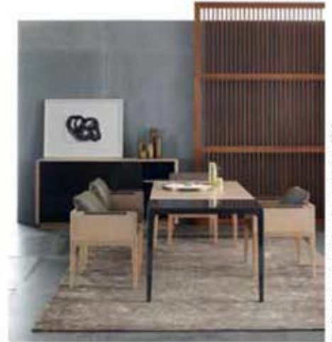
Pearlman dining room series; photos courtesy of SD

"IN 20 YEARS, I DON'T THINK THERE'S GOING TO BE A BIG CHANGE. WHATEVER IS IN STYLE NOW MAY NOT BE IN STYLE IN 20 YEARS, BUT IT MAY COME BACK IN 30 YEARS, BECAUSE DESIGN IS A CYCLE AND ALWAYS COMES BACK AGAIN."