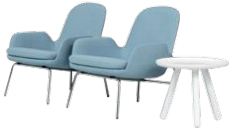
Era Lounge chair

“BROADLY SPEAKING, I THINK THAT WE SHOULD ALL KEEP QUESTIONING THE STATUS QUO, OURSELVES AND THE THINGS WE DO. TO ME, THAT’S ESSENTIAL IN ORDER TO IMPROVE THE WAY WE LIVE – AND THE ONLY WAY WE CAN CONTINUE TO MOVE FORWARD IN THE WORLD.”