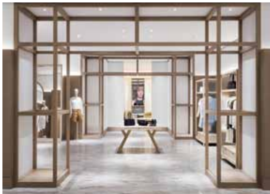
Ports 1961 boutique interior

“IN A WORLD GUIDED BY THE INTERNET, NOTHING IS REALLY UNIQUE ANYMORE. I THINK RAREFIED OBJECTS HAVE BECOME MORE IMPORTANT BECAUSE THEY ALLOW THE OWNER AND THE HOME THEY RESIDE IN TO MAINTAIN A SENSE OF IDENTITY AND INDIVIDUALITY.”