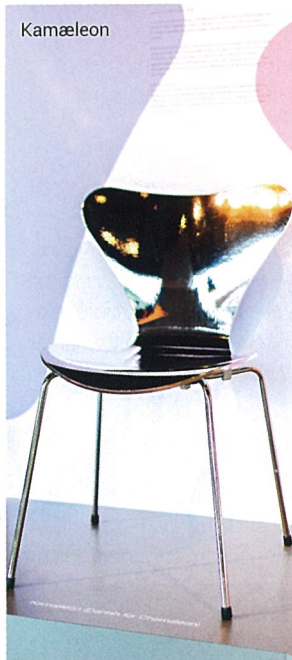
The chairs will be exhibited at the Singapore Indesign Intimate event at the National Design Centre from 9 to 10 July 2015.

"We wanted to create a space that is contemplative, yet fun. Design doesn't always need to be too serious."