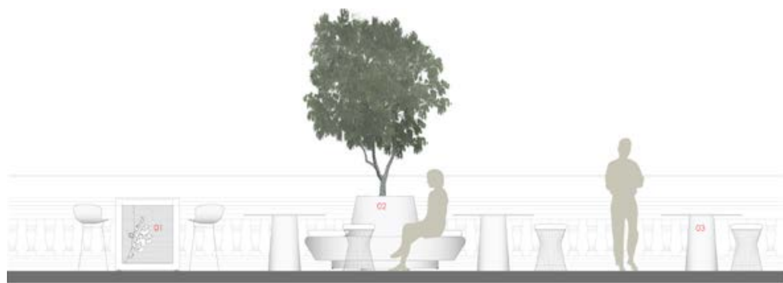
01 Counter with Bar Stool 带高脚凳的柜台 02 Planter with Seating 带座椅的盆栽 03 Lounge Seating 休闲座椅