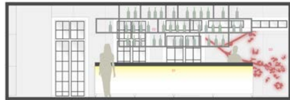
The Club L4 Layout Plan 五层平面图