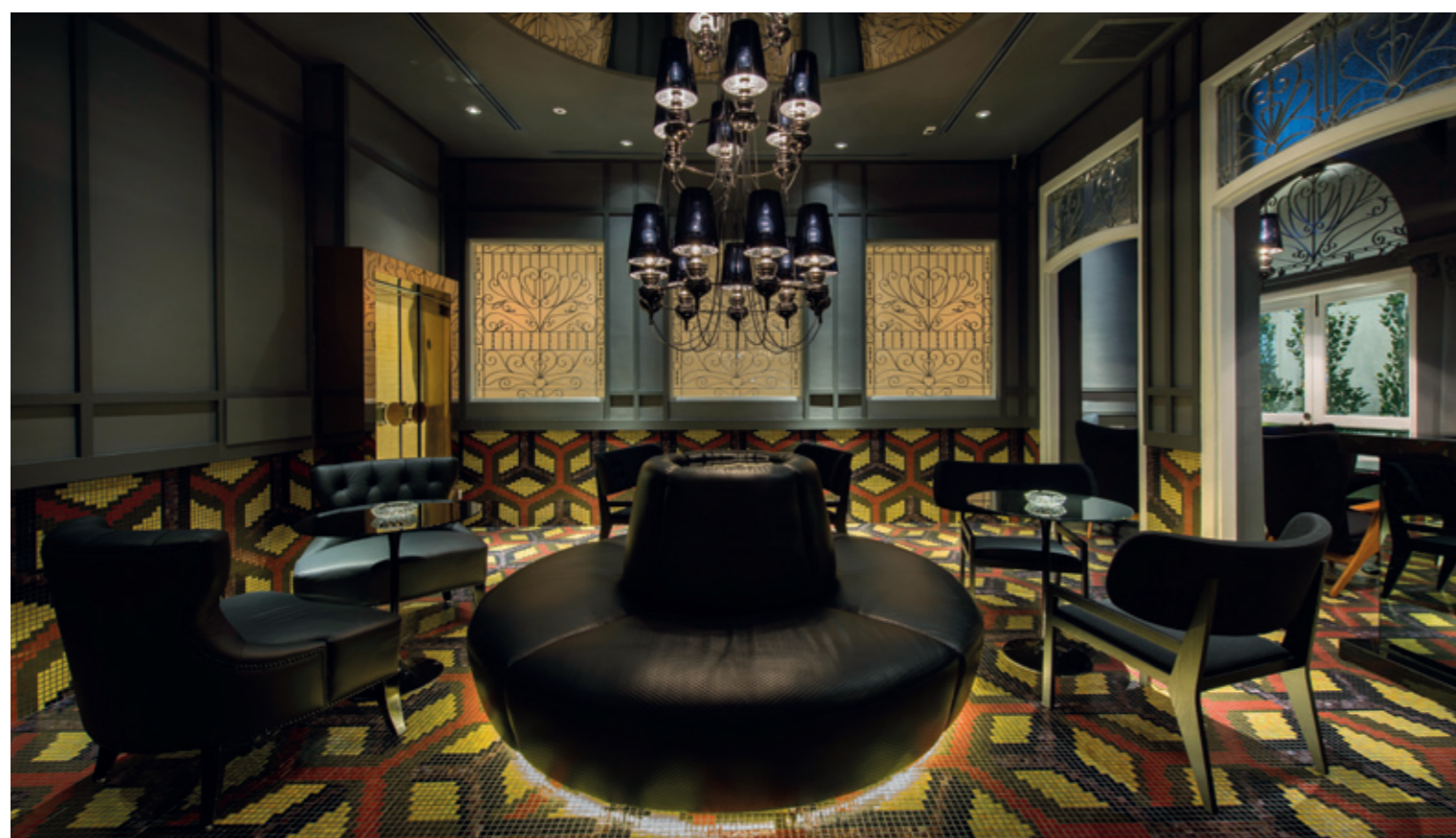
RAISE THE BAR: In The Den, a whisky and cigar bar, a striking display of mosaic floor tiling leaves a strong impression

all of Penang's other historic B&Bs and boutique hotels, which he observed were all "very Peranakan and in the Chinatown shophouses".