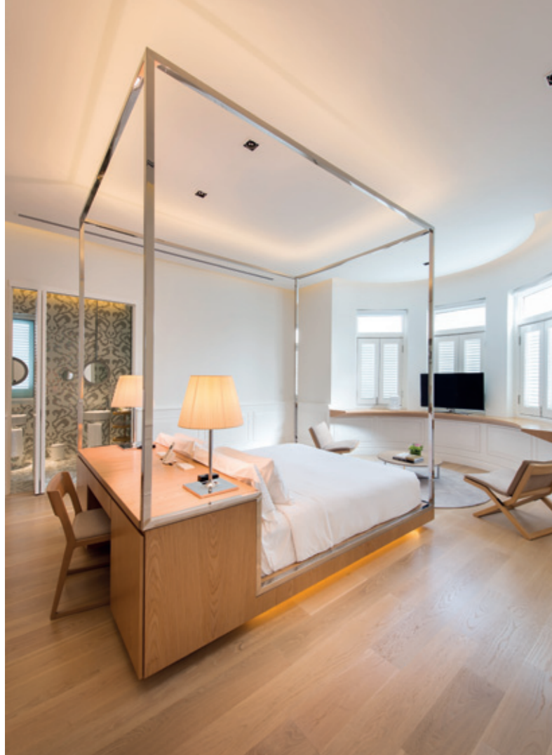
← ONE OF A KIND: Each of the eight guestrooms is appointed according to room proportion and layout