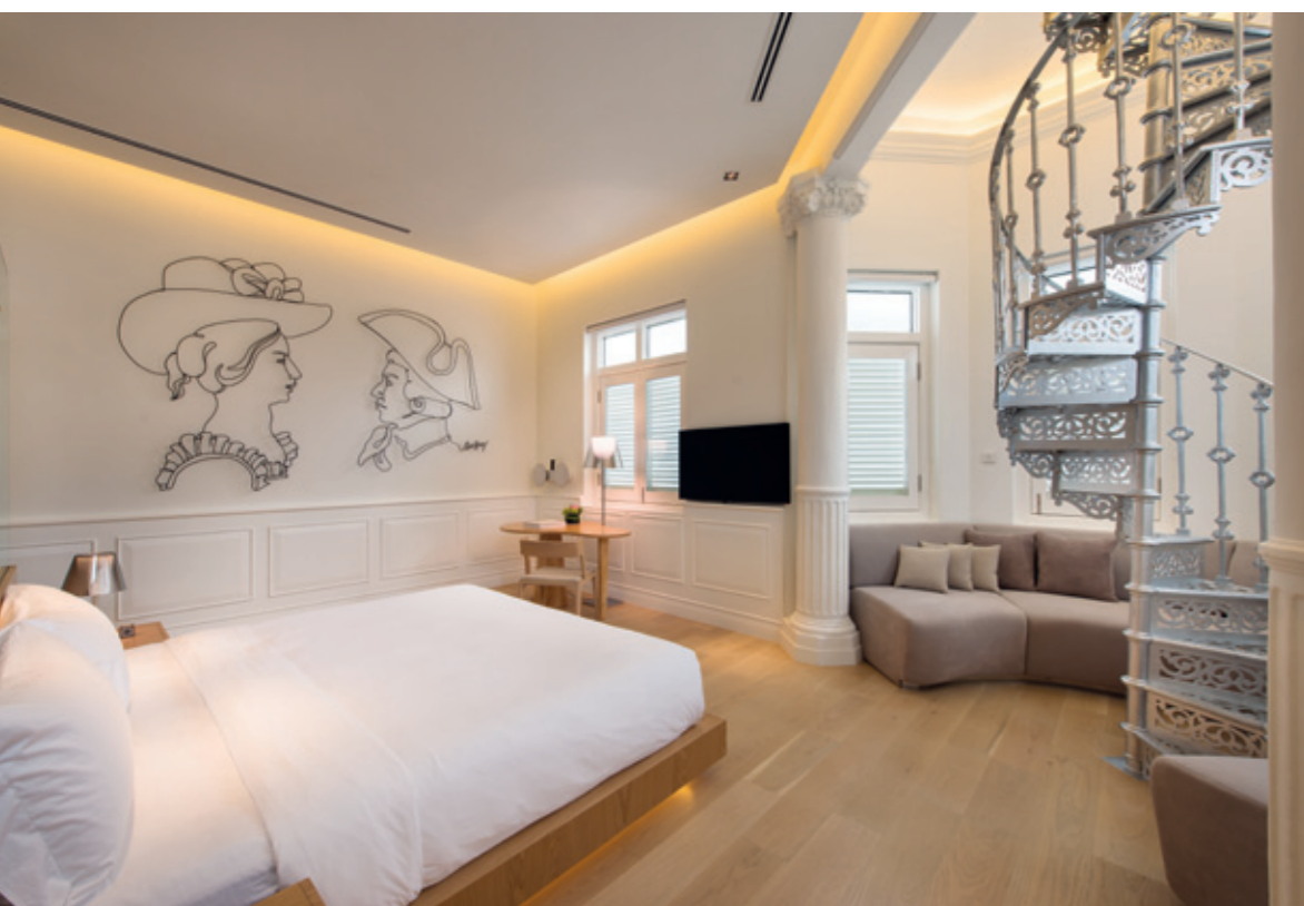
↑ THE ART OF: Specially commissioned artwork give each room its own art and twist

preserving original architectural window grilles or tiles and fitting the rooms out to five-star standard (as was done) but also through creating memorable moments – whether by having site-specific in-room artwork that cleverly weave in stories or history, or by juxtaposing a modern check-in bar (complete with video art and indie electronic music in background) with a precedent experience of coming under a turquoise, scalloped canopy and through a pair of restored ornate wooden double-leaf doorway.