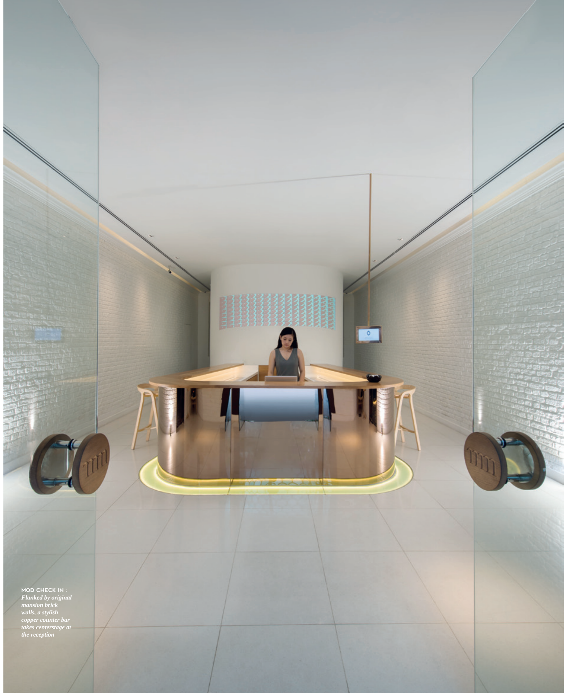
MOD CHECK IN : Flanked by original mansion brick walls, a stylish copper counter bar takes centerstage at the reception