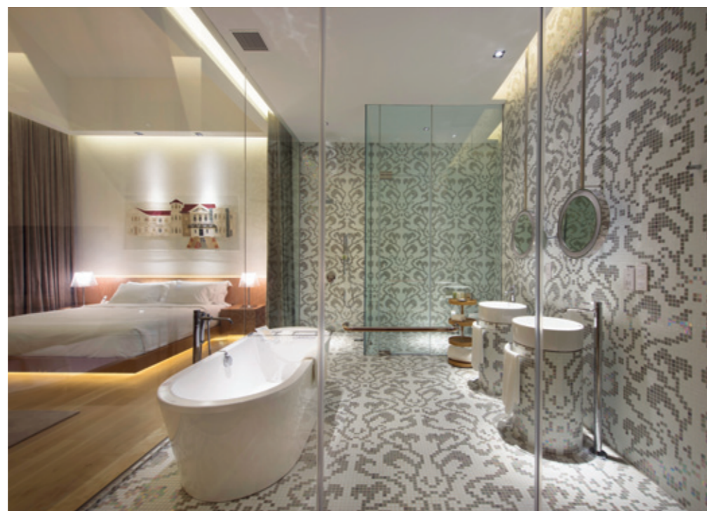
↓ THE TILE PICTURE: Guests luxuriate in ensuite bathrooms wrapped in silver-white, filigree- inspired mosaic tiling