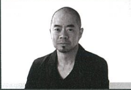
MINISTRY OF DESIGN PTE LTD